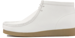
007SM- White Smooth