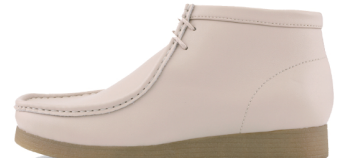
008SM- Beige Smooth