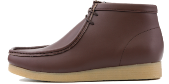
065SM- Brown Smooth