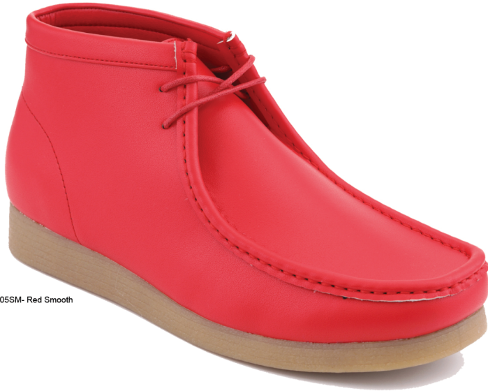
005SM- Red Smooth