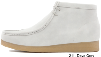
211- Dove Grey