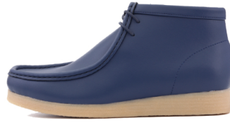
002SM- Navy Smooth