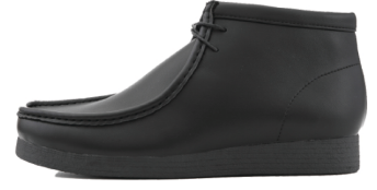
000SM- Black Smooth