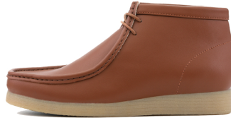
215SM- Cognac Smooth